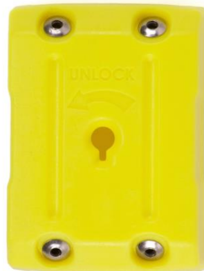
High Visibility Yellow (HVY) (Optional)