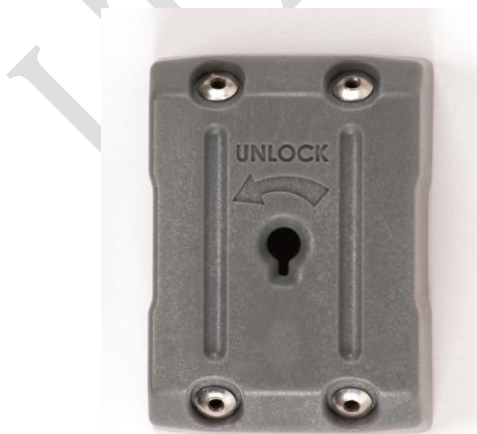
Gum Metal Color (Standard)

The key cannot be removed with the UniLock in the "unlock" position.